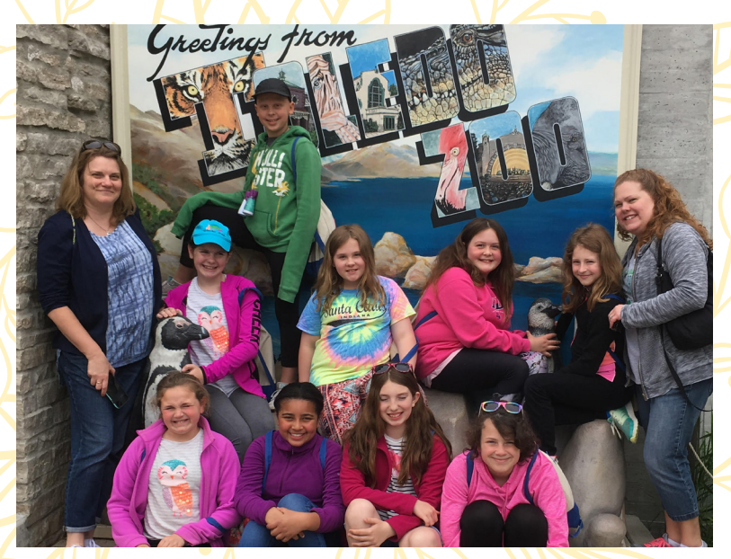
Mishawaka Catholic Club