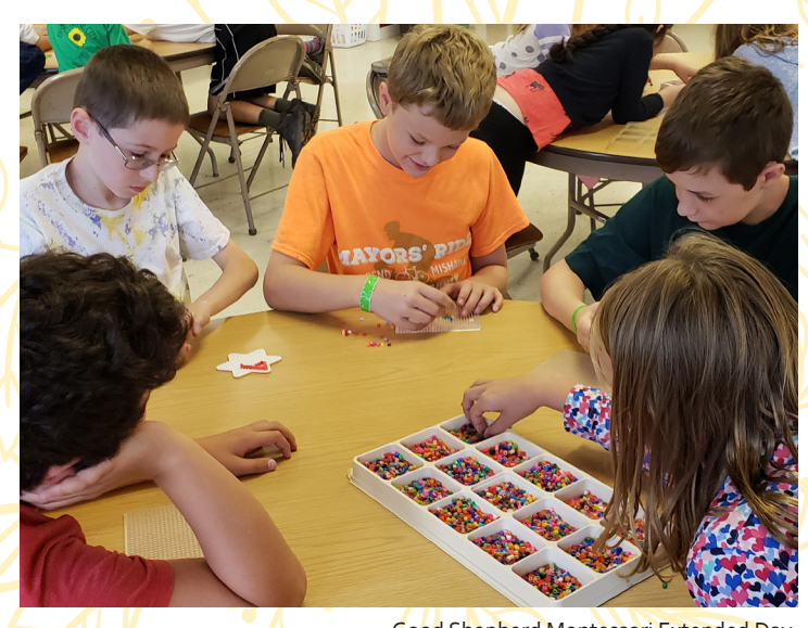
Good Shepherd Montessori Extended Day

Contributions may be unrestricted, or designated for camperships, programs, facilities improvements, or the new building fund.