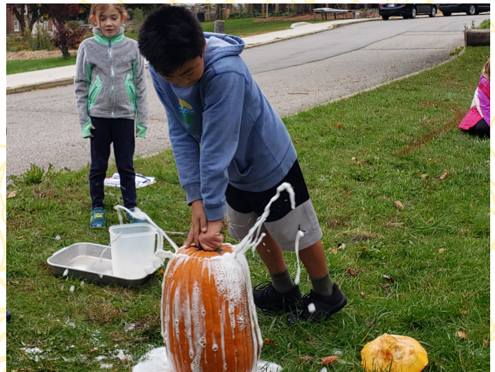
Good Shepherd Montessori Extended Day

Contributions may be unrestricted, or designated for camperships, programs, or facilities.