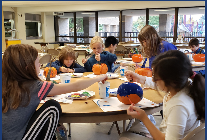
Good Shepherd Montessori Extended Day