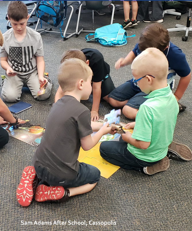
Sam Adams After School, Cassopolis