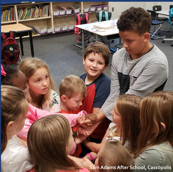
Sam Adams After School, Cassopolis