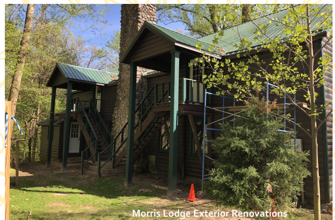
Morris Lodge Exterior Renovations