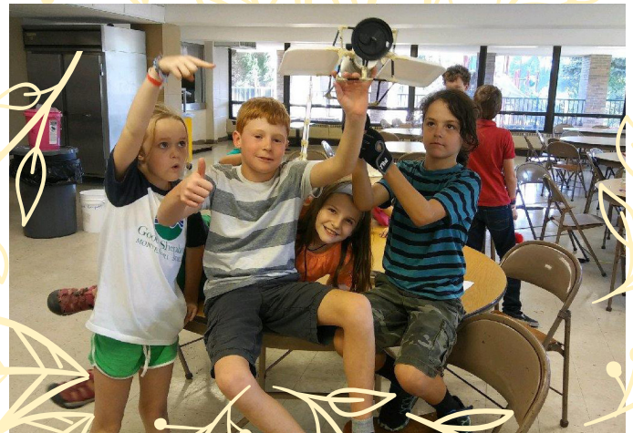
Good Shepherd Montessori Extended Day