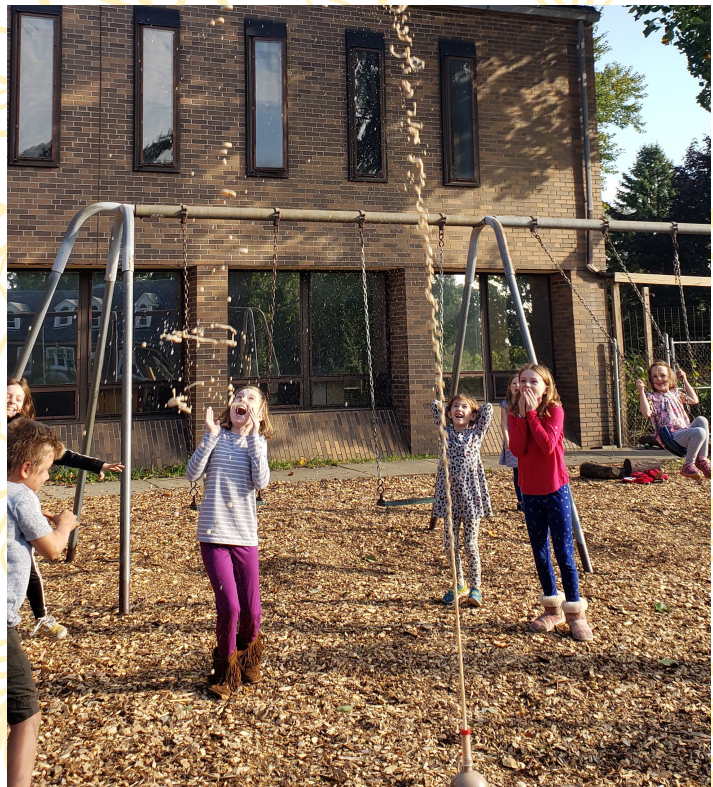
Good Shepherd Montessori Extended Day