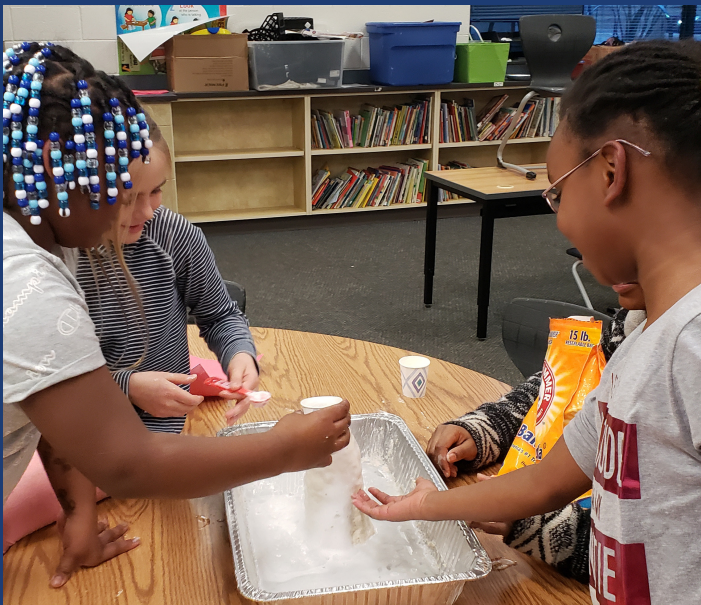
After School at Sam Adams Elementary