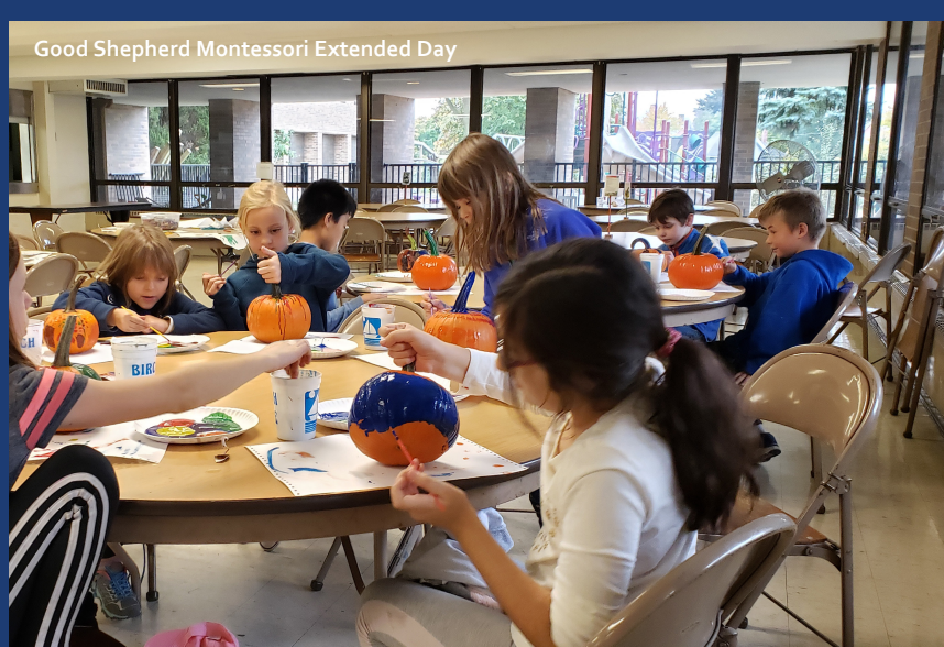
Good Shepherd Montessori Extended Day