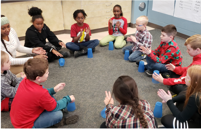
After School at Sam Adams Elementary