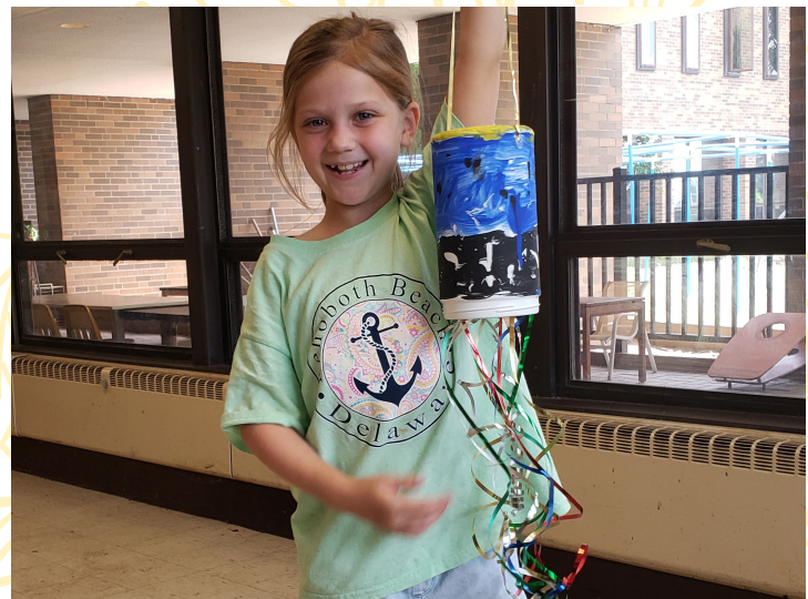
Good Shepherd Montessori Extended Day

Contributions may be unrestricted, or designated for camperships, programs, or facilities.