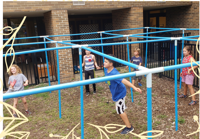
Good Shepherd Montessori Extended Day