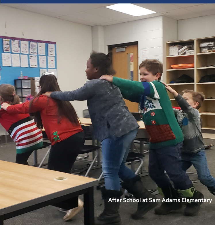
After School at Sam Adams Elementary